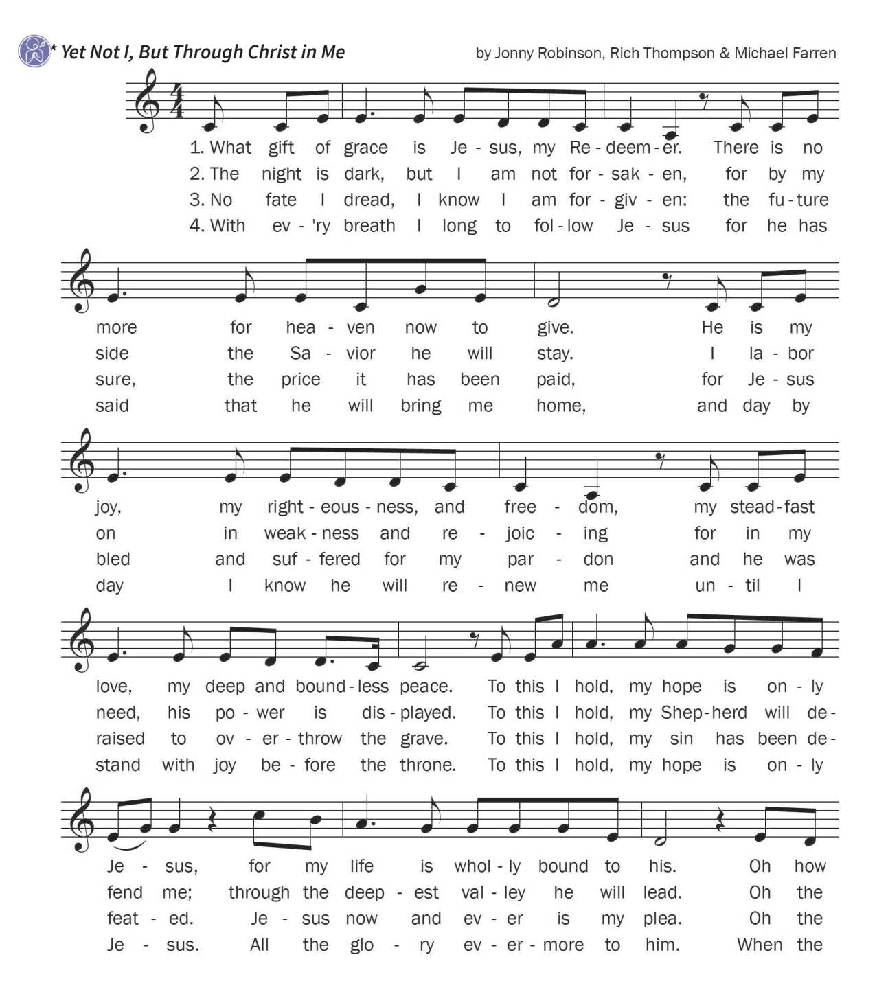
DEDICATING OURSELVES TO GOD